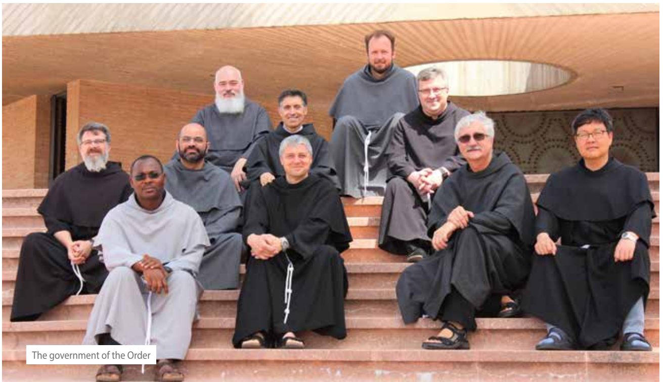
The government of the Order