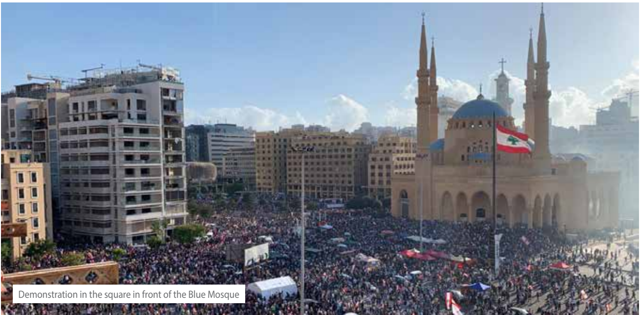
Demonstration in the square in front of the Blue Mosque

Finally, the scouts felt compelled to volunteer because so little relief was being offered by the government, which, they said, was even slow to provide minimal waste removal after the blast.