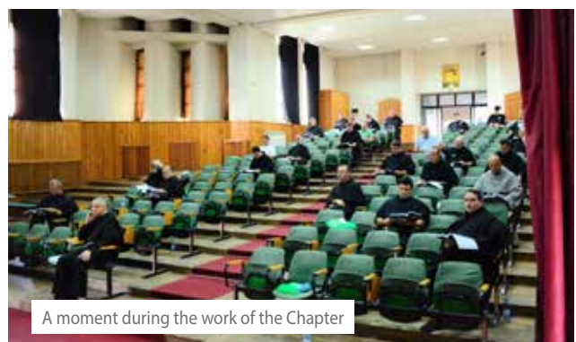
A moment during the work of the Chapter