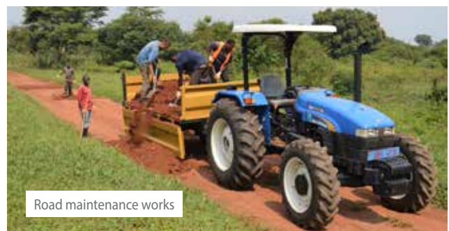
Road maintenance works