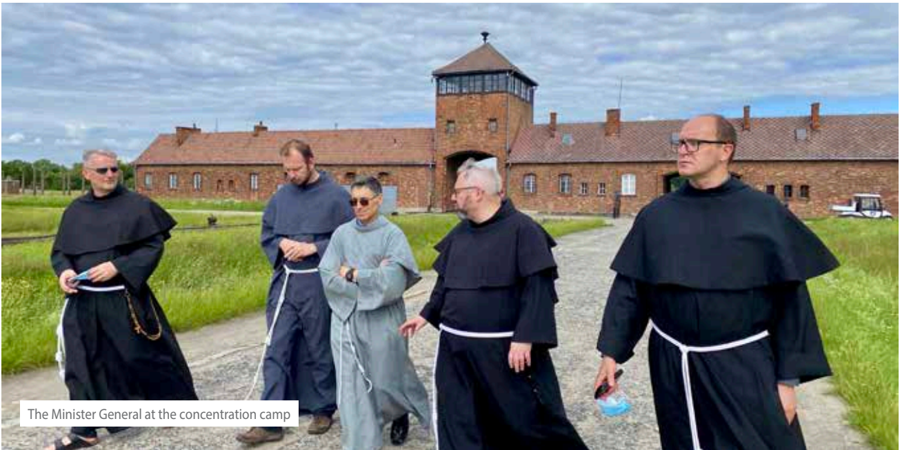
The Minister General at the concentration camp

of massive love. It was as though St. Maximilian's great love were still present, mixed with the cold air and darkness of the cell. Moreover, this is a great mystery, because that love is Love with a capital L; it is the love of the Lord. I also experienced union with the Cross, the Cross of Jesus; not as an abstract idea, not as a rational discourse, but just as a feeling, because that was Love, too. In the isolation of the cell, facing death, in the dark, in spite of everything, one still feels Love with a capital L.