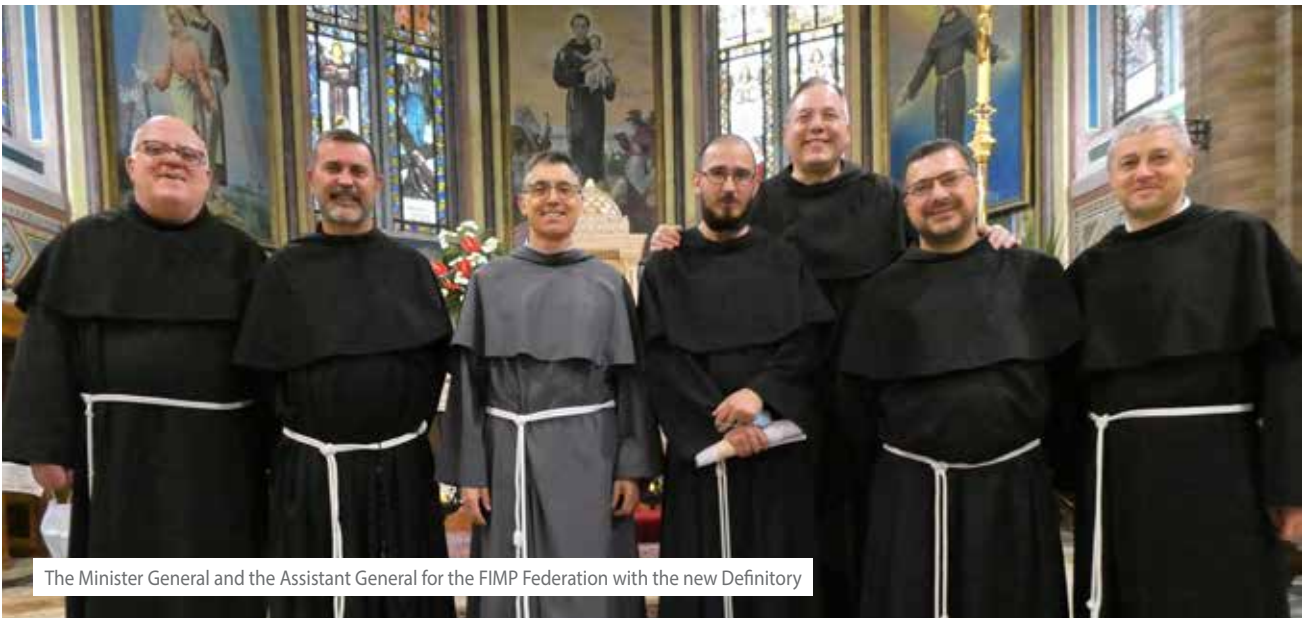
The Minister General and the Assistant General for the FIMP Federation with the new Definitory