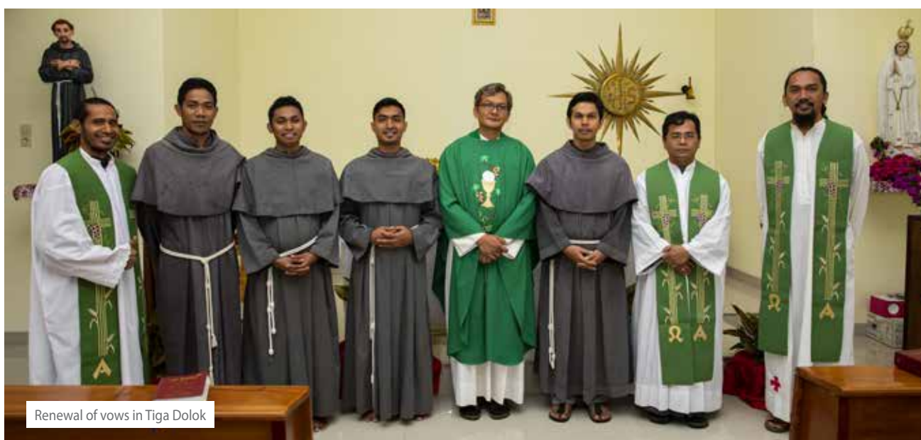
Renewal of vows in Tiga Dolok