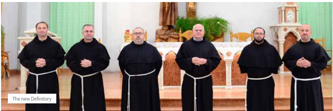
The new Definitory

During the second part of the Chapter (August 5-7), certain specific topics were studied, a basic outline of the Province Four-Year Plan was drawn up and the Guardians were elected as were the heads of various Provincial offices.