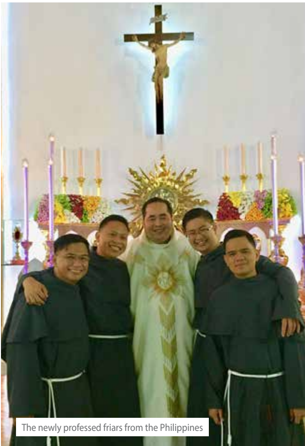
The newly professed friars from the Philippines

The celebration ended with an agape meal attended by the resident friars, their formators and some friars from Multinational, Paranaque City who also assisted during the Mass.