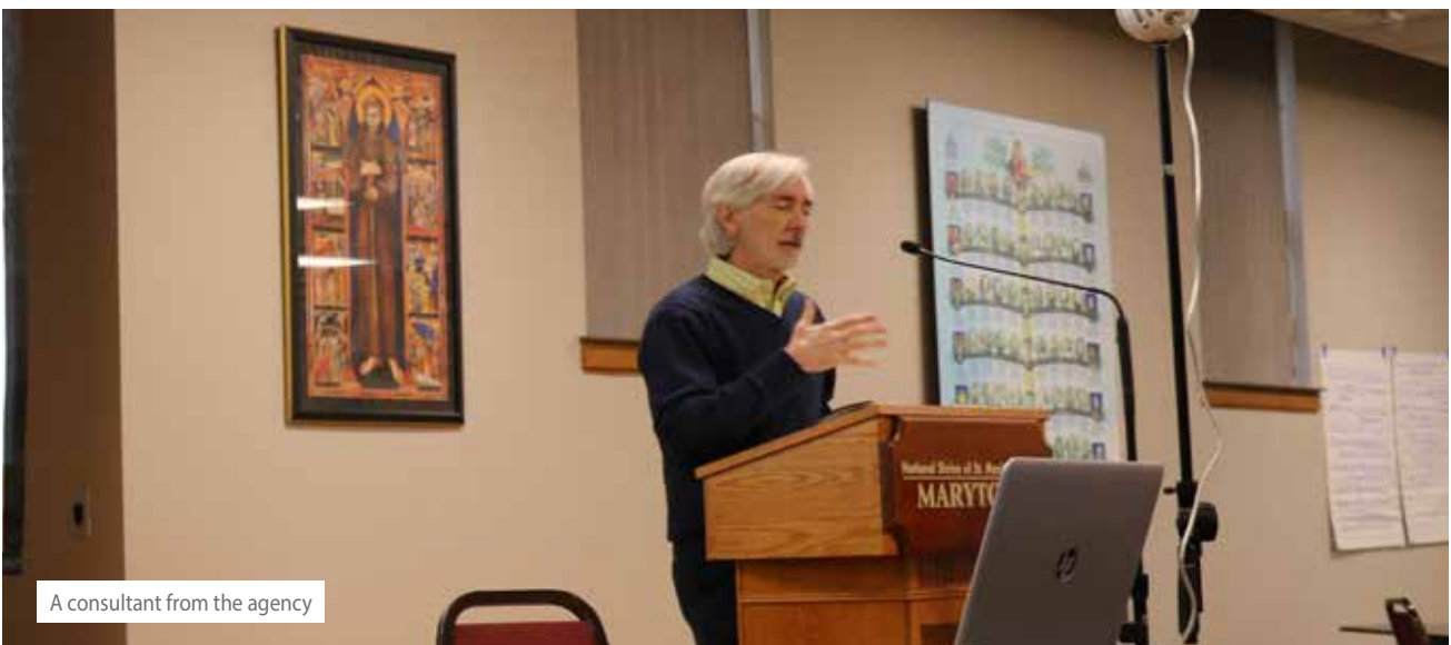
A consultant from the agency