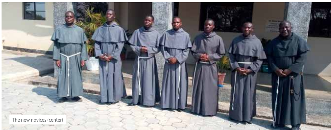
The new novices (center)