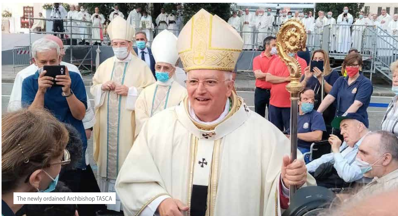
The newly ordained Archbishop TASCA