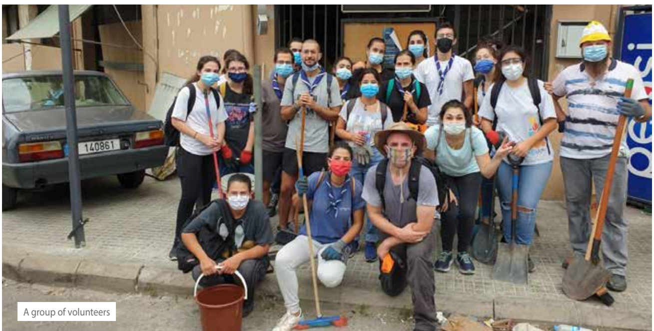
A group of volunteers

Beirut's impoverished Karantina district is close to the port where the explosion occurred. The situation there was dire. The blast tore away the