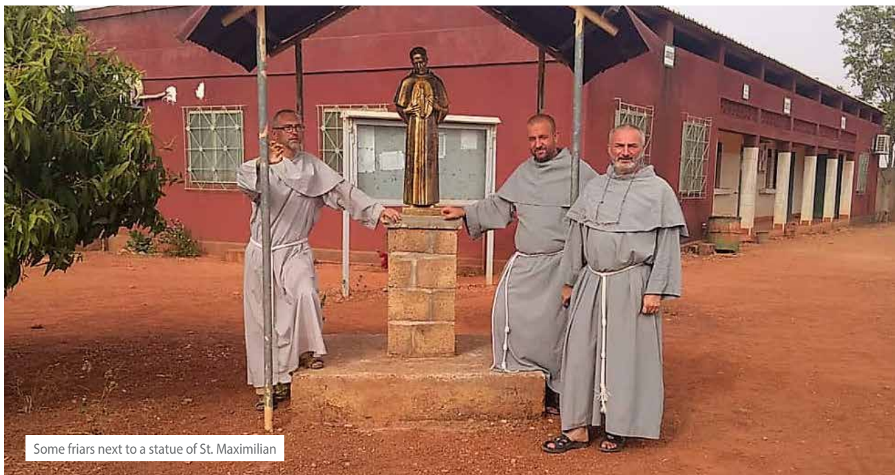
Some friars next to a statue of St. Maximilian