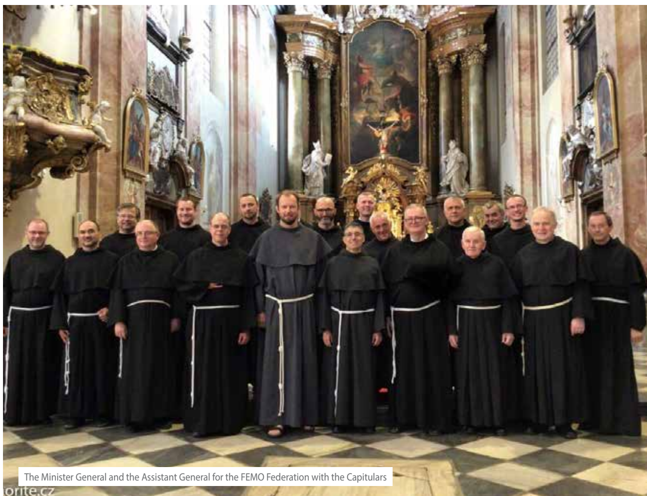
The Minister General and the Assistant General for the FEMO Federation with the Capitulars

On the last day of the Chapter, the friars selected some points from the evaluation of the life of the Province and handed them over to the Provincial Definitory. They will be used to prepare the Instrumentum Laboris for the second part of the Chapter, which will be celebrated November 23-25, 2020.