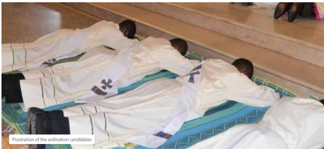
Prostration of the ordination candidates