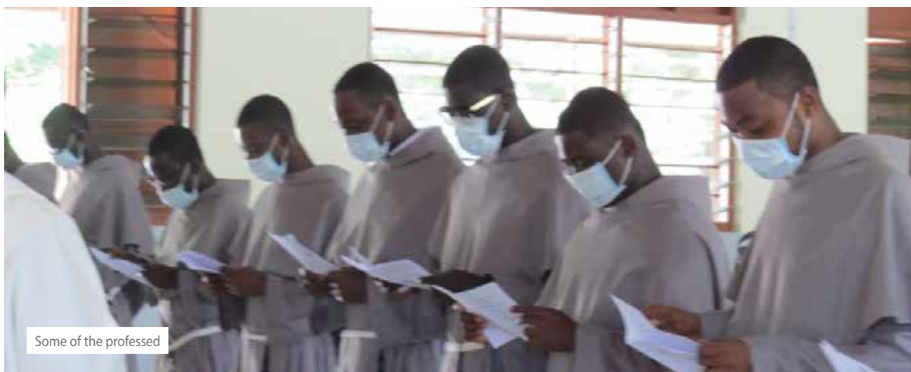
Some of the professed