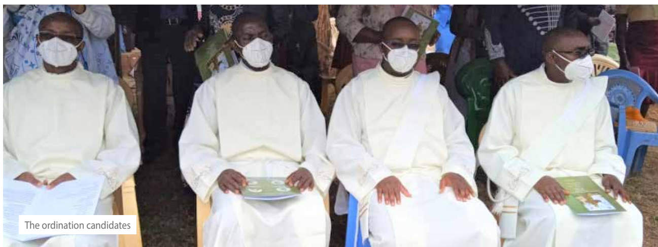
The ordination candidates

Hearty congratulations to our brothers and may the Lord strengthen them in their new apostolates.