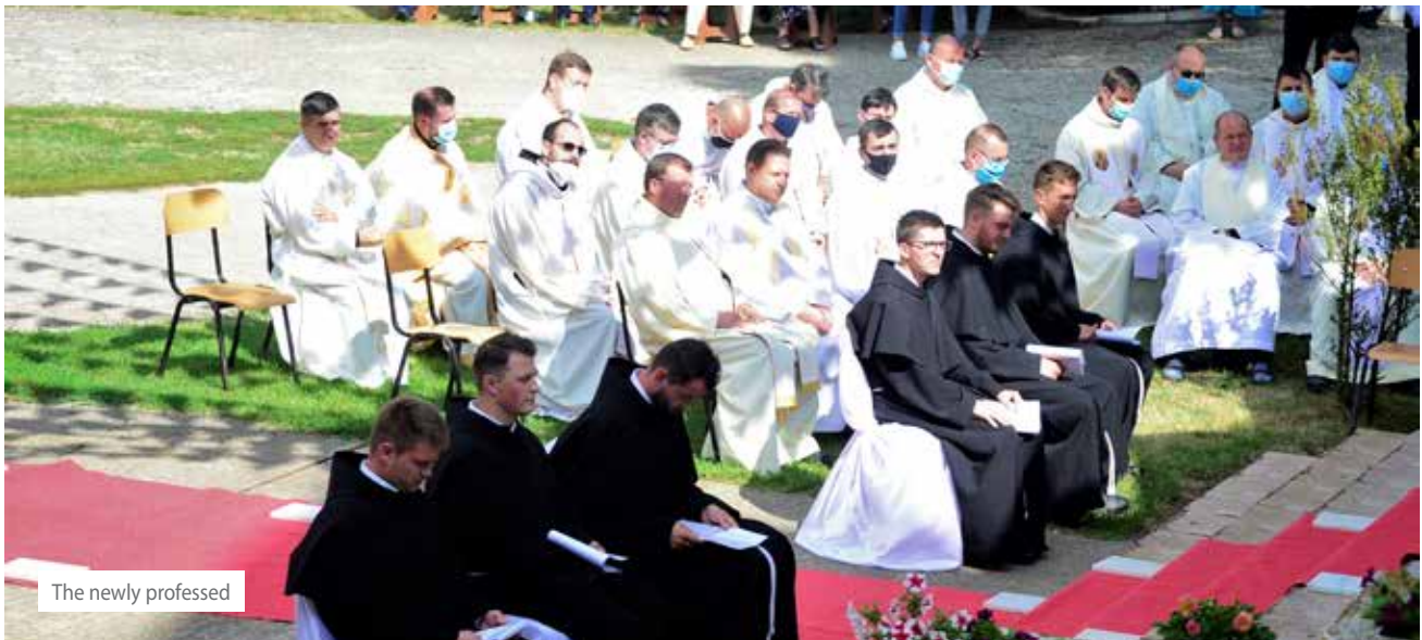
The newly professed

We pledge to pray fervently for our newly professed confreres.