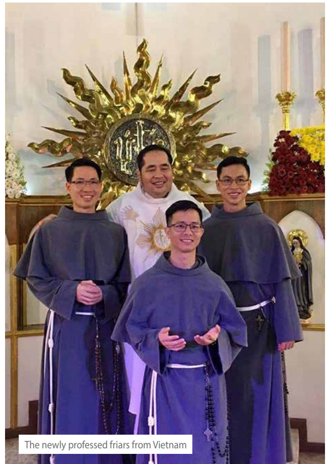
The newly professed friars from Vietnam