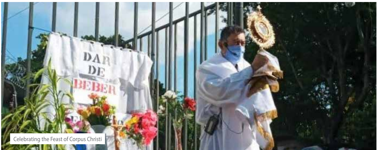
Celebrating the Feast of Corpus Christi

We continue to pray, smile, work and dream. Life continues and is renewed in ways we never expected, because “this is eternal life, that they should know you, the only true God, and the one whom you sent, Jesus Christ” (Jn 17:3). In the midst of this pandemic, we are recognizing that a little more.