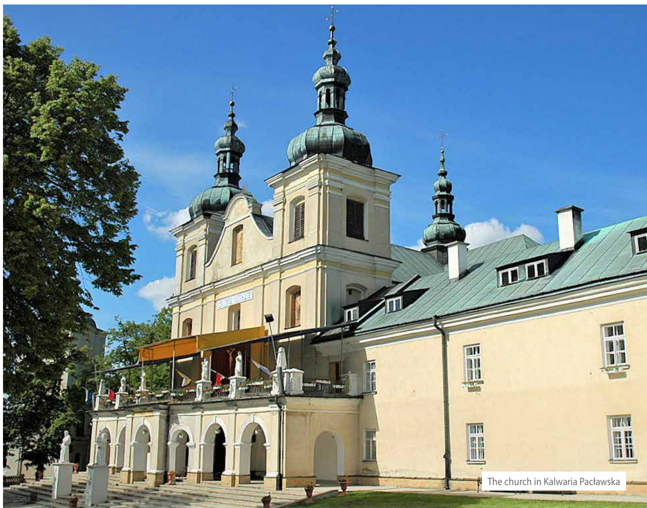
The church in Kalwaria Pałacowska

importance as pilgrimage sites. Known as the “Jerusalem of the East”, by some, or “Jasna Góra Podkarpacia” [Luminous Mount of Subcarpathia] by others, Kalwaria Pałacowska has been waiting for this moment for almost four centuries.