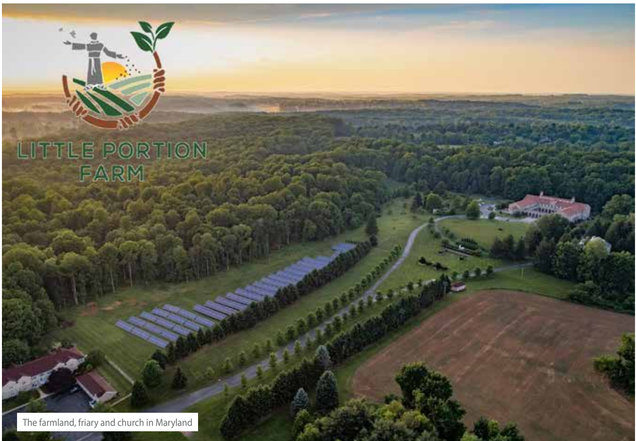
The farmland, friary and church in Maryland

These confreres of ours reside at the Provincial Curia and at the OLA Shrine of St. Anthony in Ellicott City, Maryland. We are truly grateful to the Lord for always offering us a better way!