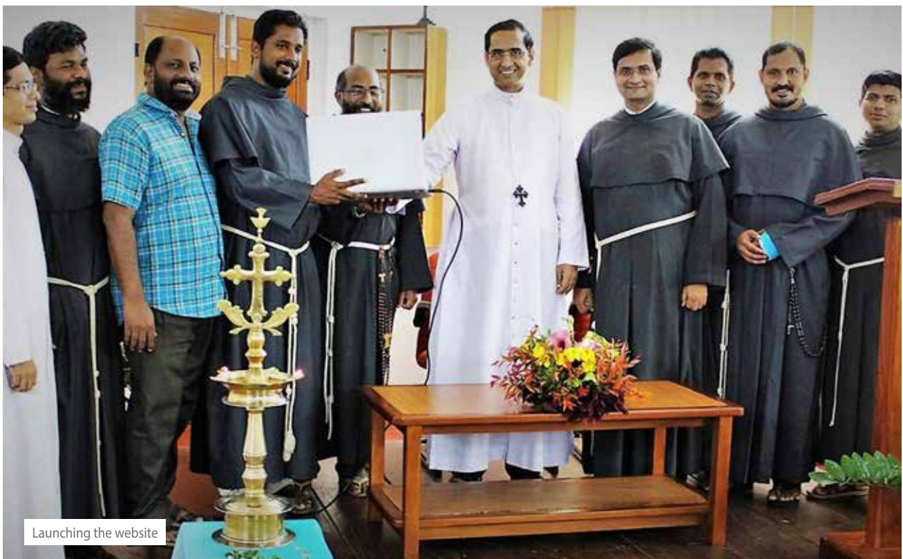
Launching the website