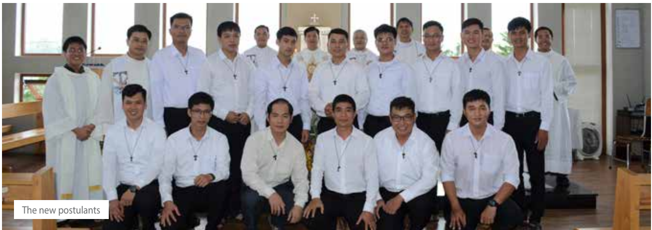
The new postulants