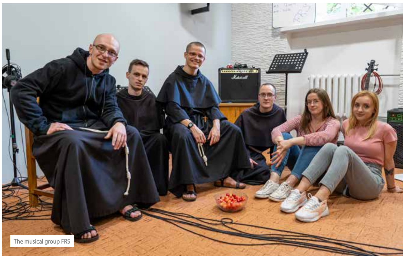
The musical group FRS