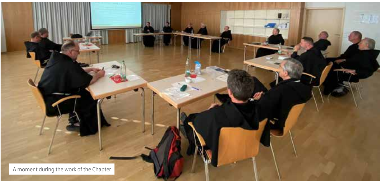
A moment during the work of the Chapter

Let us pray to the Lord to bless the new friary: “New wine for new wineskins” (Mt 9:17).