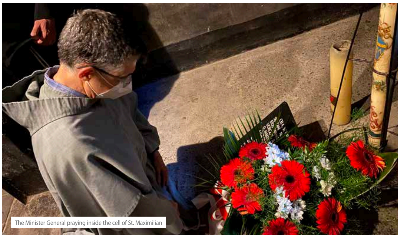
The Minister General praying inside the cell of St. Maximilian

This is a strange place because, although it is a place of death, the first feeling I experienced was one