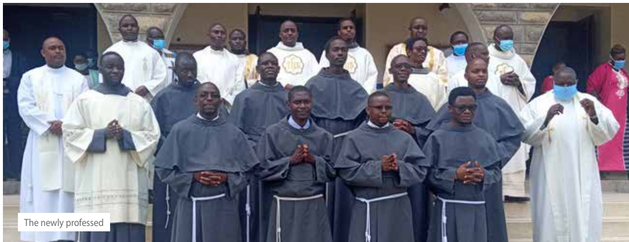
The newly professed