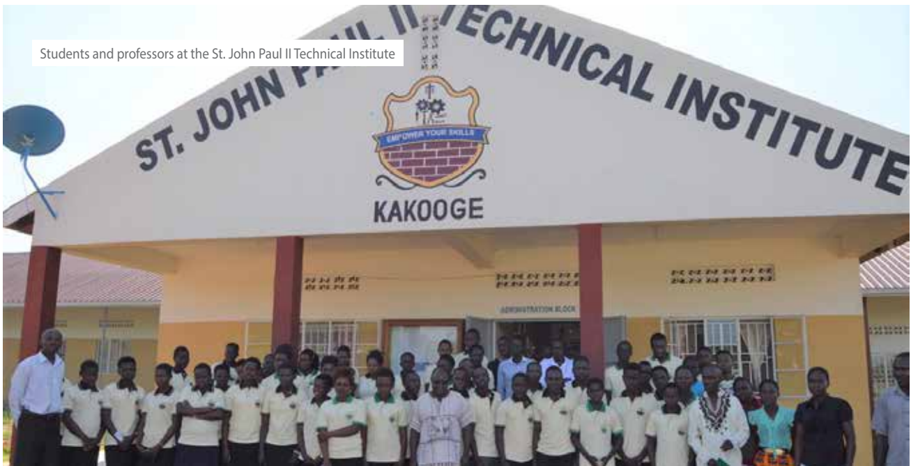
Students and professors at the St. John Paul II Technical Institute

In the near future, there are plans to devote twenty hectares (fifty acres) of land to grow corn, peanuts, sweet potatoes and cassava. The goal is to provide better nutrition to the novices and the vocational school students. Unfortunately, in 2020, the students have been unable to take advantage of the farm's benefits because the school has been closed due to the pandemic.