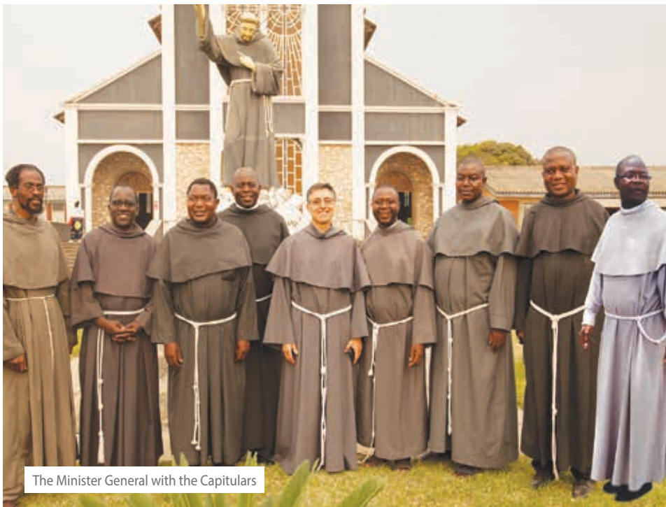
The Minister General with the Capitulars

The second part of the Chapter has been scheduled for October 12-16, 2020. At that time, the Capitulars will approve the Provincial Four-Year Plan and elect the Provincial Econom, the Guardians and the Directors of the Commissions.