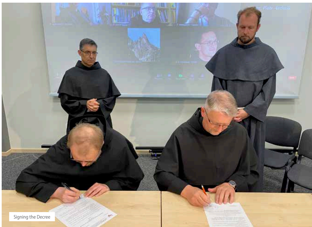
Signing the Decree

In the Decree of Erection we read: "Being thankful to God for seven centuries of presence by the spiritual sons of St. Francis of Assisi in this territory known today as the Ukraine; and being mindful of the foundation laid by Duke Władysław Opolczyk in 1372, particularly the construction of the Church of the Holy