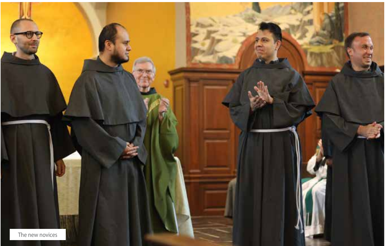
The new novices

Let us remember these new novices in our prayers and ask the Lord to bless them and support them on the journey.