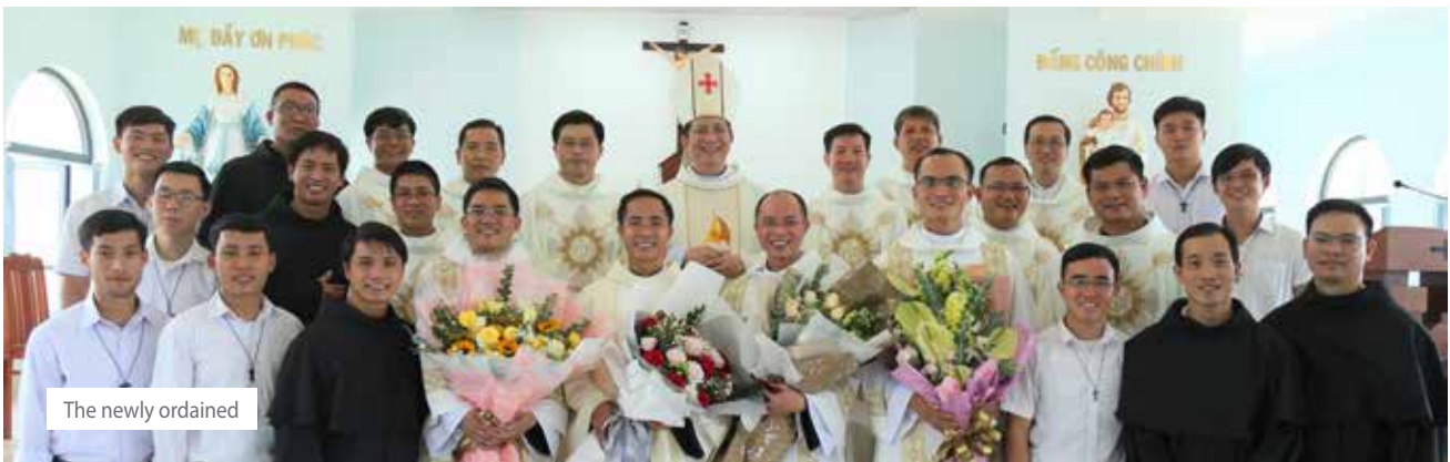
The newly ordained