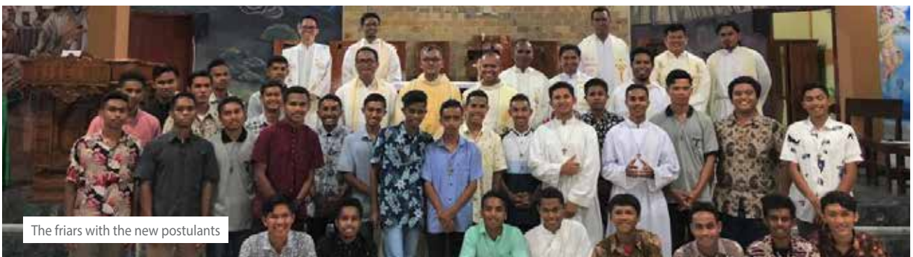
The friars with the new postulants