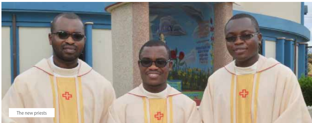
The new priests