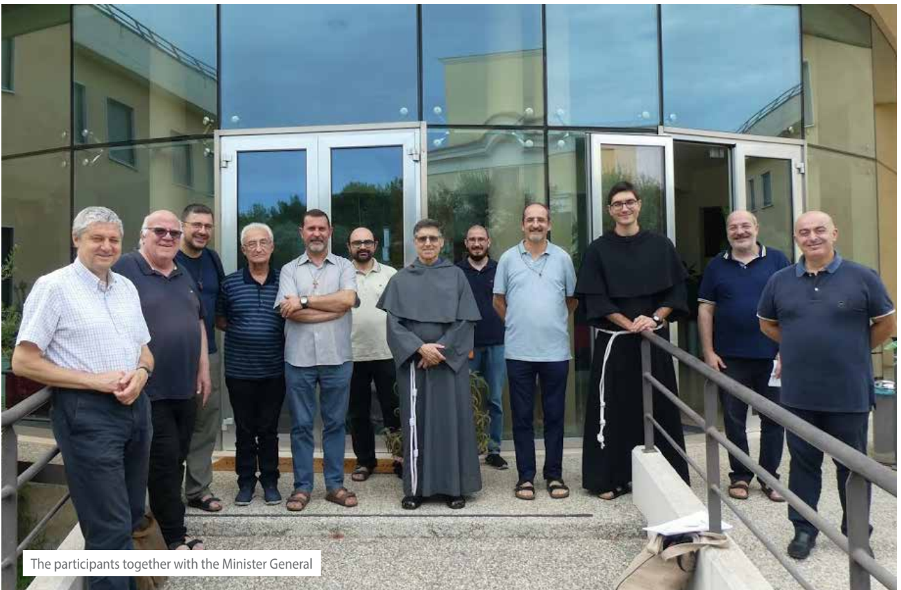
The participants together with the Minister General

The next joint session is scheduled for December 14, 2020, in Lucera, Italy.