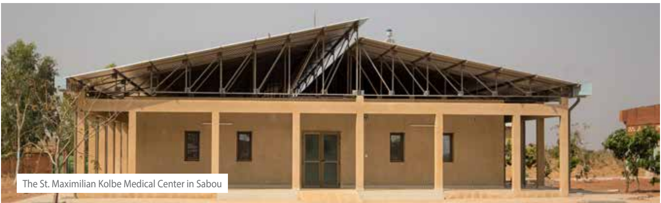
The St. Maximilian Kolbe Medical Center in Sabou