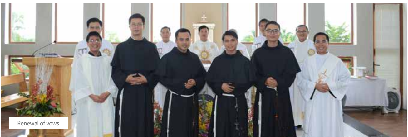
Renewal of vows