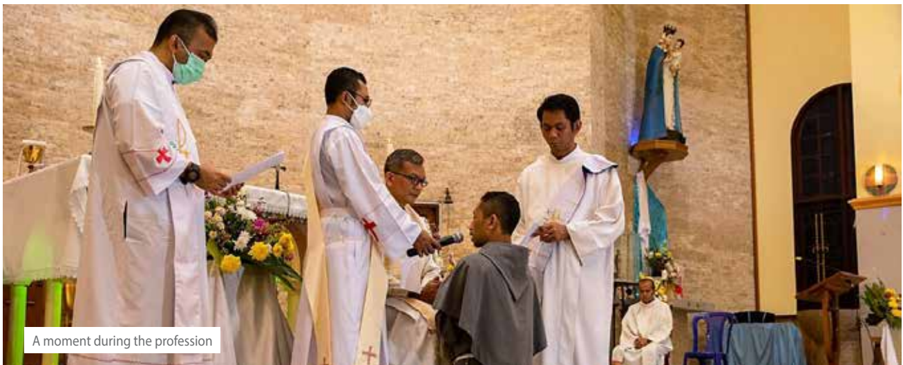
A moment during the profession

We pledge to pray fervently for each of them.