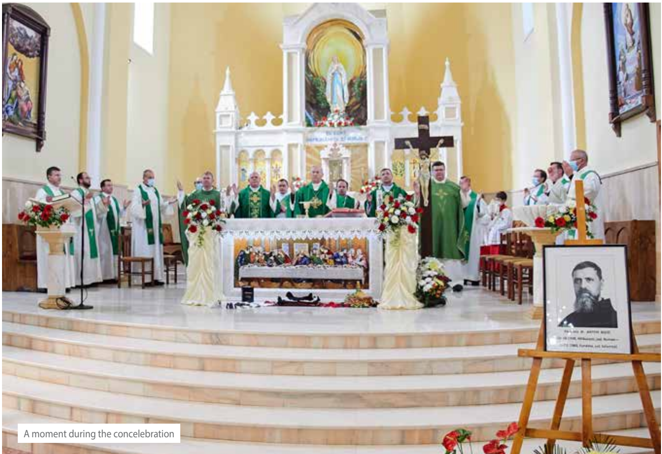
A moment during the concelebration