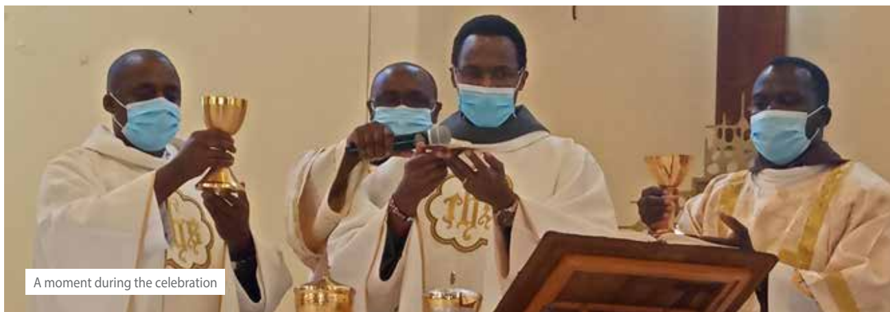
A moment during the celebration

Congratulations to our brothers! May they be strengthened in their zeal to follow the poor and humble Christ in the Conventual Franciscan family.