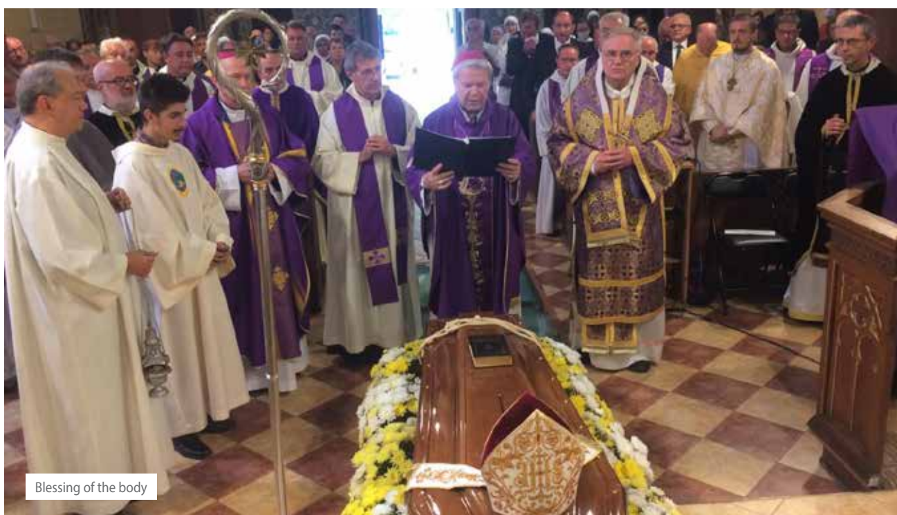
Blessing of the body

May the Lord reward the sacrifice of his pastoral ministry by welcoming him into his Kingdom. Through his intercession with the Good Shepherd, may new vocations be sent to serve the Church in Bulgaria.