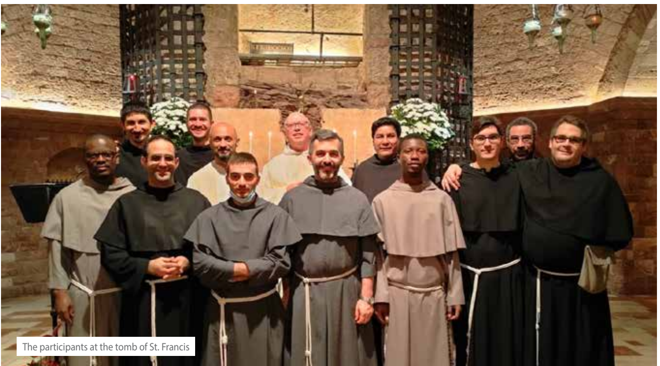
The participants at the tomb of St. Francis