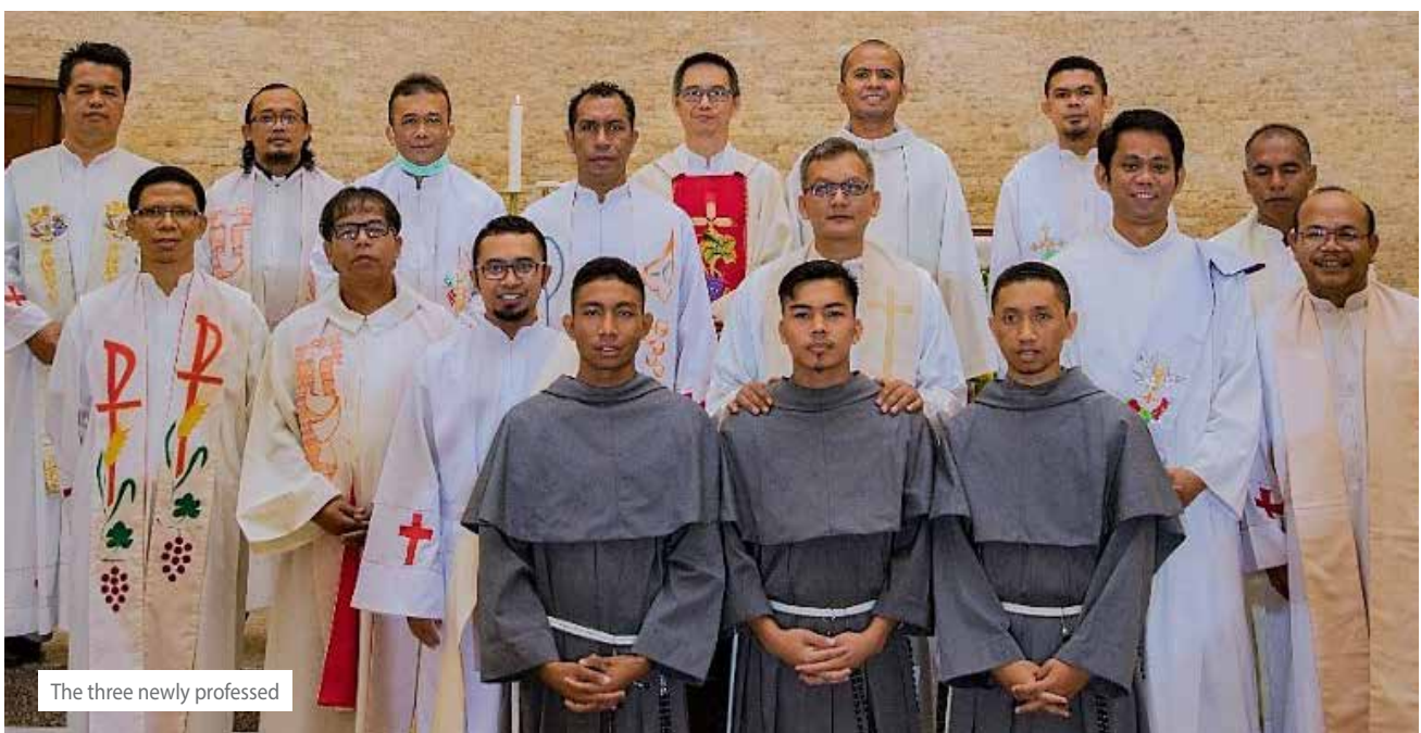
The three newly professed