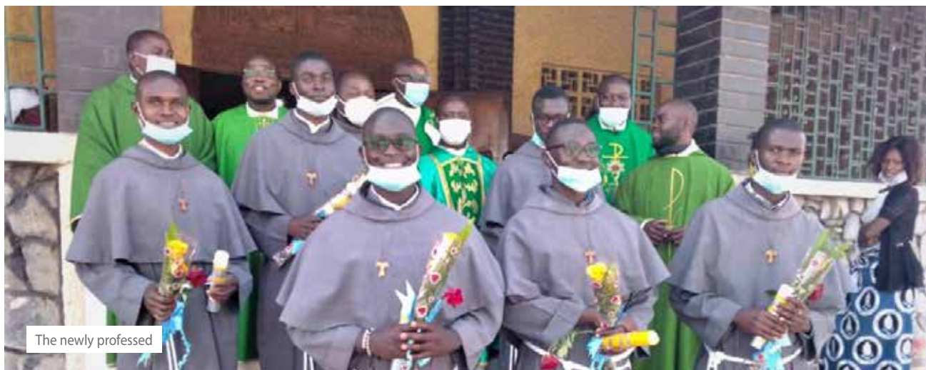
The newly professed

We pledge to pray fervently for our newly professed and novice confreres.