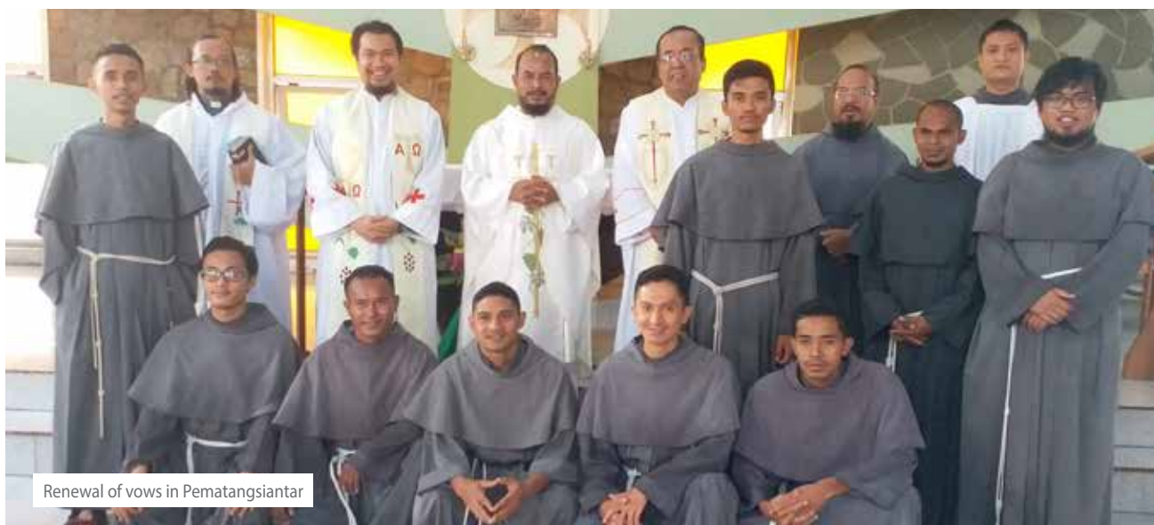
Renewal of vows in Pematangsiantar