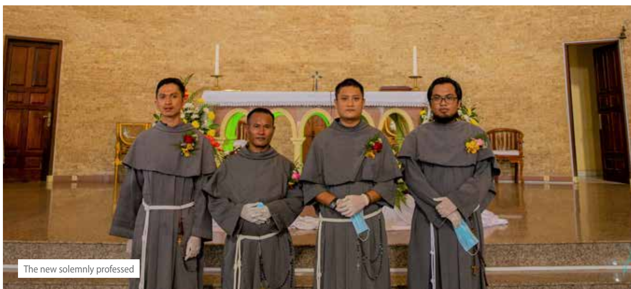
The new solemnly professed